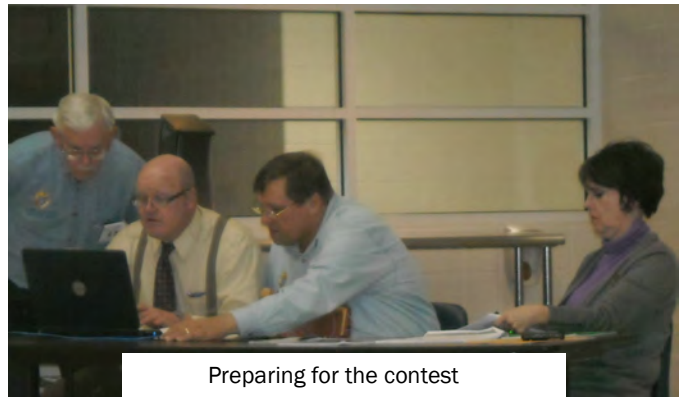
Preparing for the contest

The top three spellers will try to advance to the Illinois State competition at the Regional Spelling Bee that will be held in the St Mary School gym on Saturday March 23 starting at 11:00 AM. Come to the Regional Bee (after the Regional Free Throw contest) to be amazed by the skill of our young people.